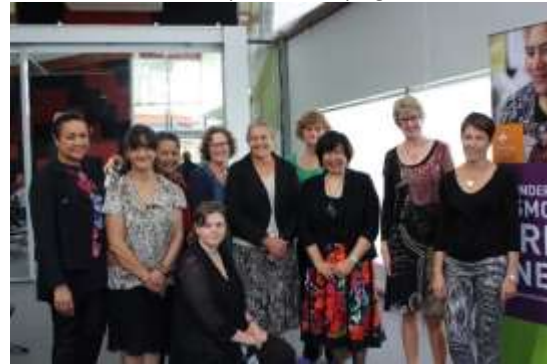
What Smokers Really Want Campaign launch 2014