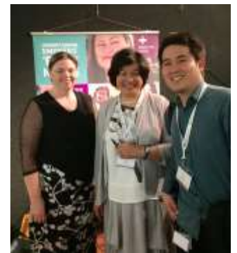
Nurse Educators Conference

We would like to thank all the nurses who have supported us in our work. Our committed steering group deserve a special mention and we leave you with some photos of them and some of the other nurses who have supported us over the last few years.