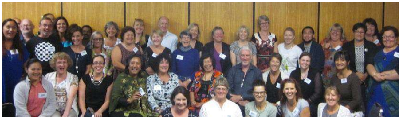
Attendees at the Smokefree Nurses Forum March 2015